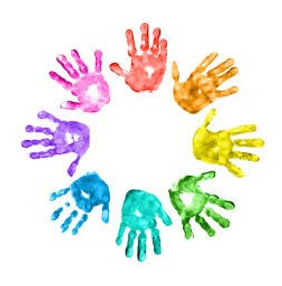
I praíse you because I am fearfully and wonderfully made!